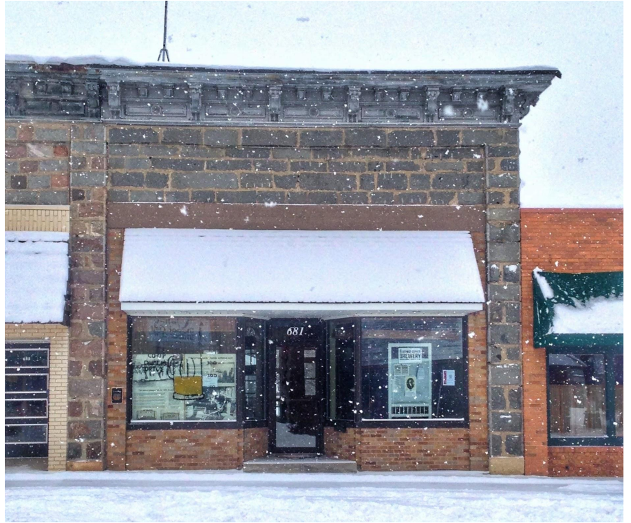
Bluenose Gopher Public House, downtown Granite Falls, MN