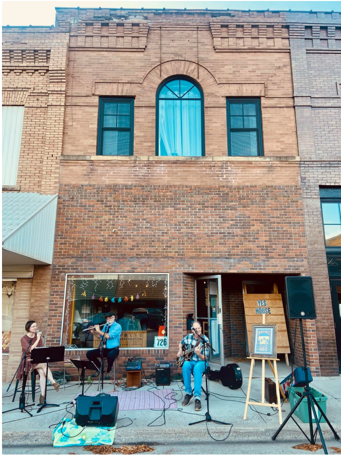
The YES! House, downtown Granite Falls, MN